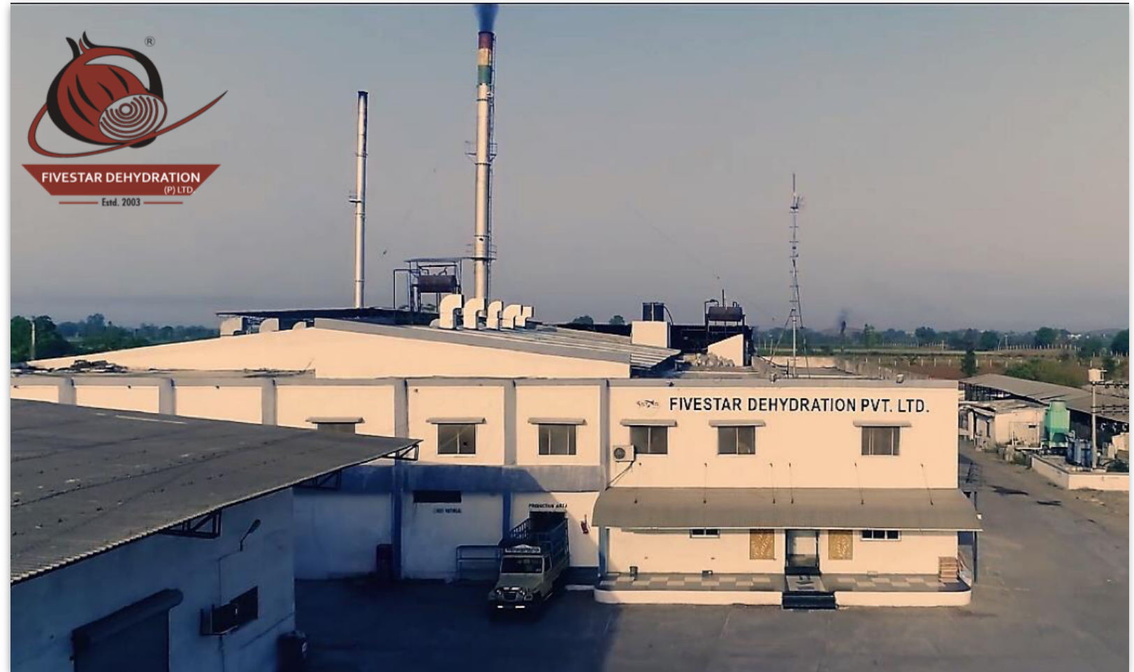
Fivestar Dehydration Private Limited Campus - Talaja (India)

Fivestar Dehydration P. Ltd. is committed to providing its customers with the best possible service and the highest-quality products. The company has been audited and credited by major international organizations, including BRC, Kosher, FSSM 220000, APEDA and Halal, which is a testament to its commitment to quality and customer satisfaction. Apart from this Fivestar is also the member of Star Export House Recognised by the government of